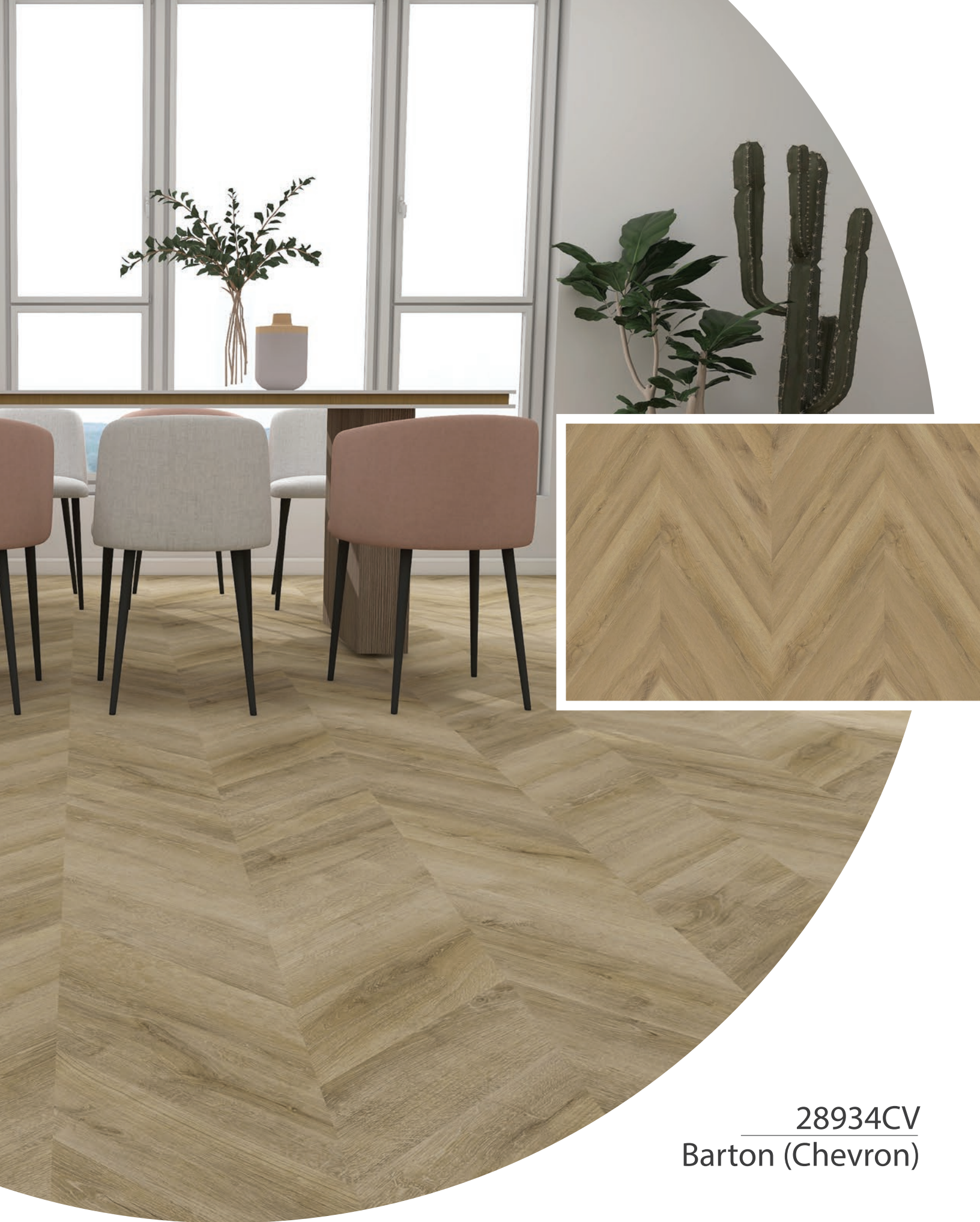
28934CV Barton (Chevron)