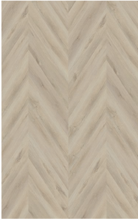
28932CV Larrose (Chevron)