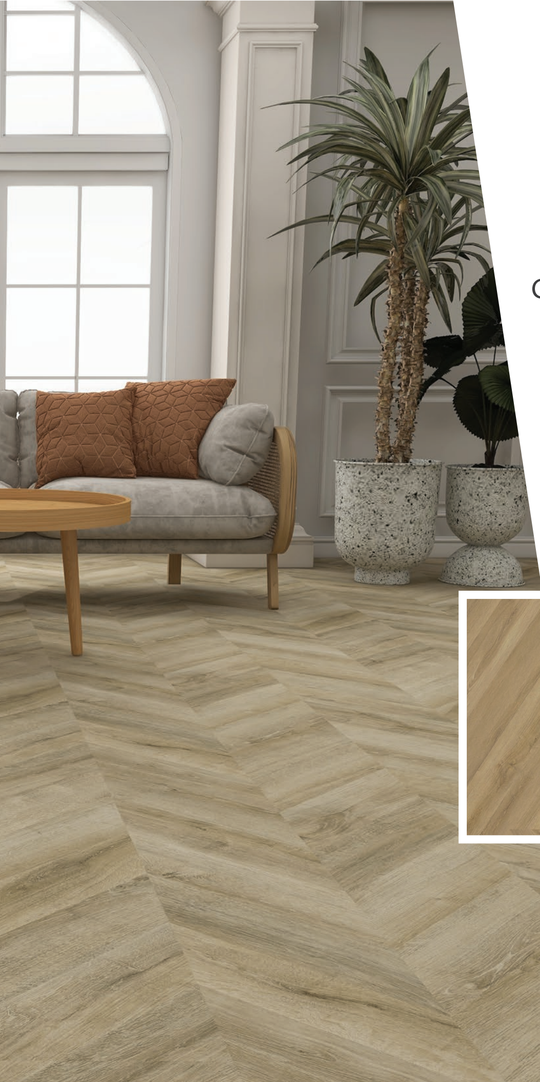
28930CV Chambertin (Chevron)