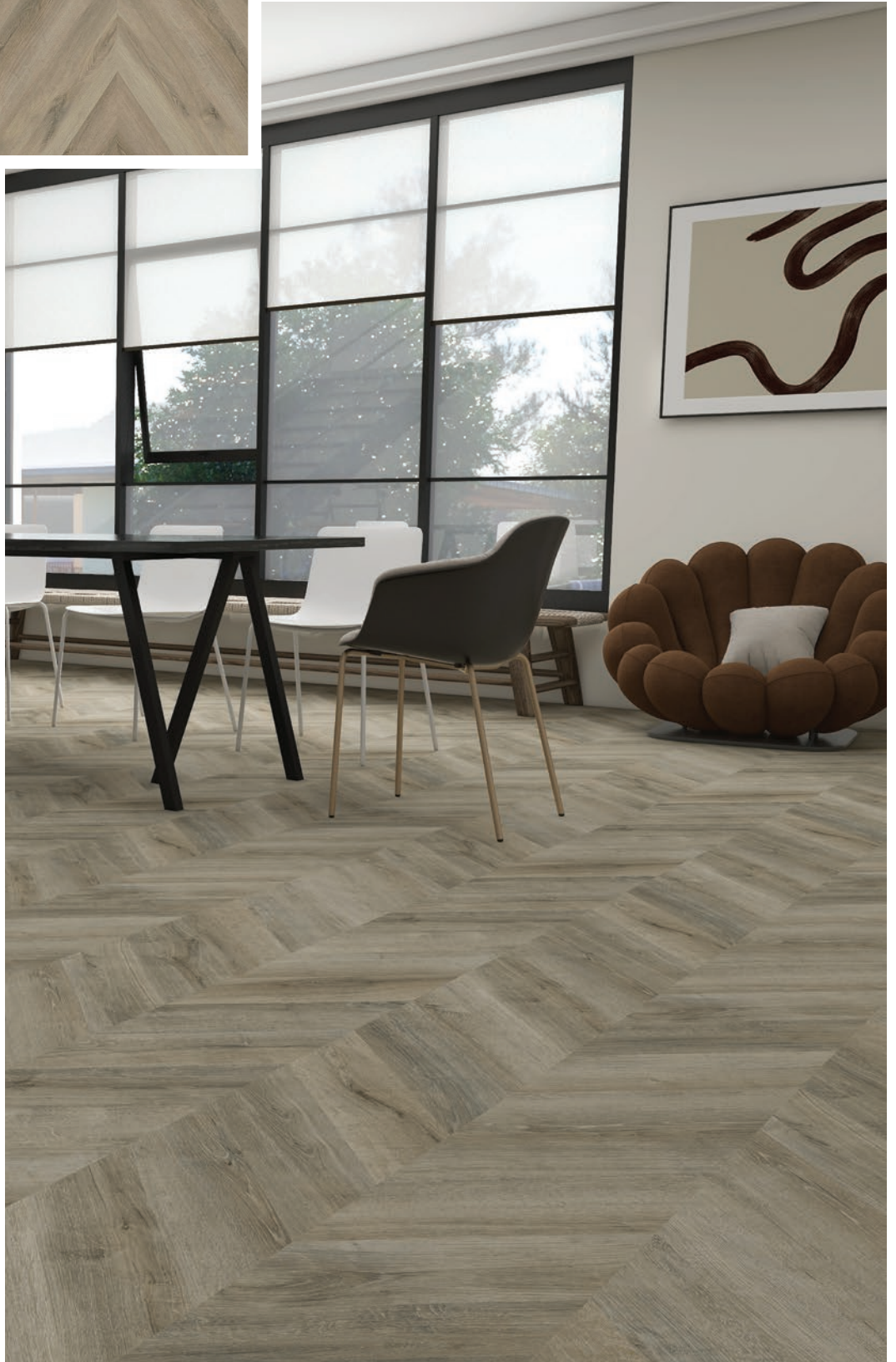
28937CV Corbin (Chevron)