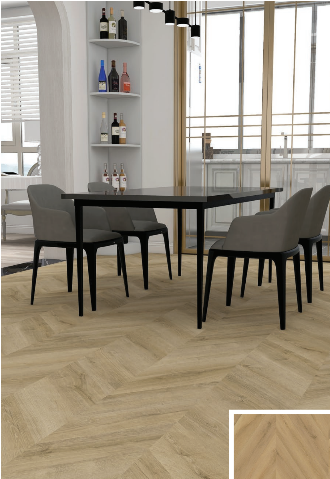
28936CV Chauvin (Chevron)