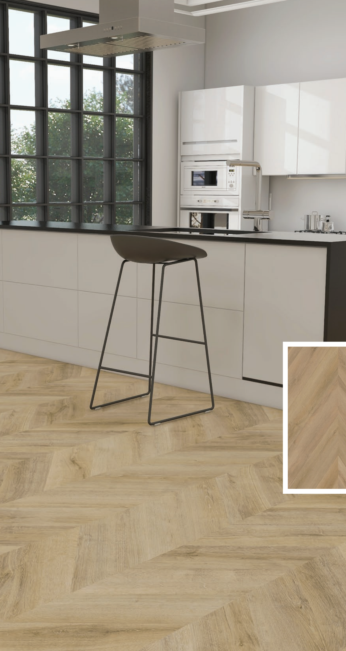
28939CV Montlisse (Chevron)