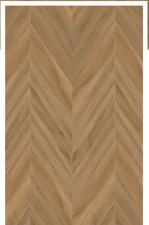
28933CV Lascombes (Chevron)